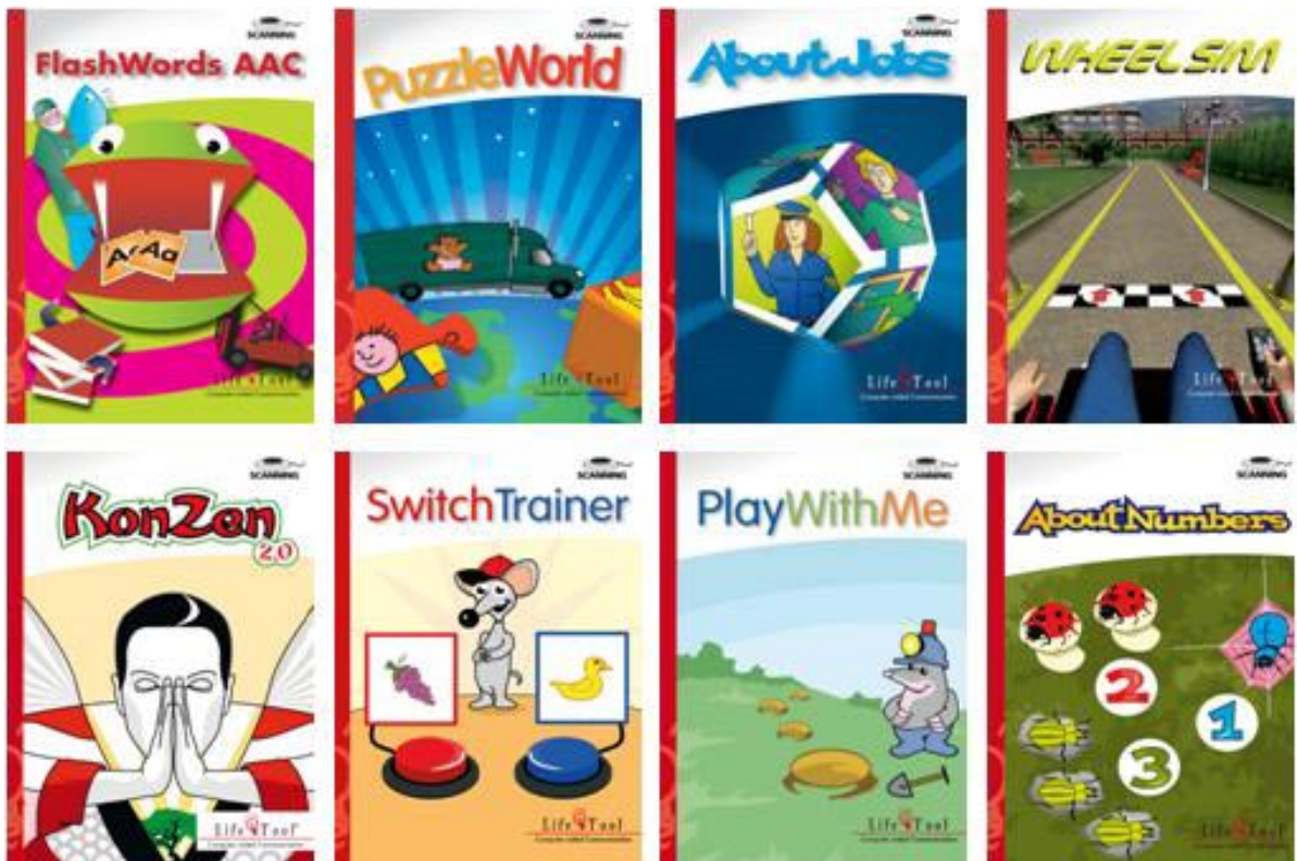
A selection of LifeTool Software programs